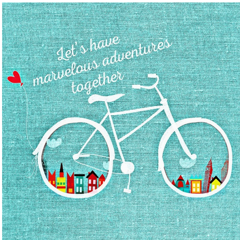
The Czech Team from VOŠ a SOŠ Březnice Czech Republic